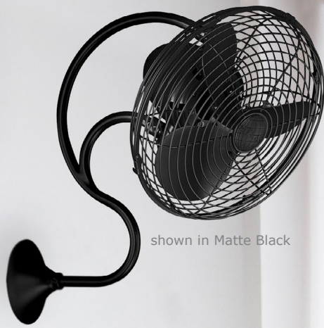
shown in Matte Black